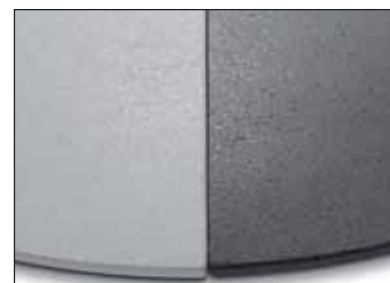
new cement tops

For technical specifications of the materials, see page 4.49.